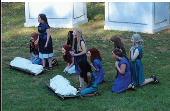
Plays are great classroom activities: Students at Randolph College perform Seven Against Thebes