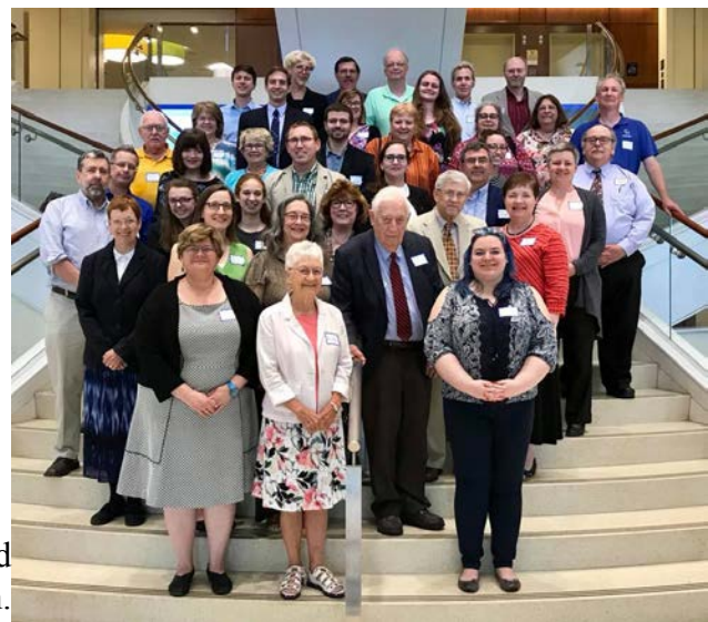
Attendees at the Spring Meeting hosted by the University of Mary Washington.