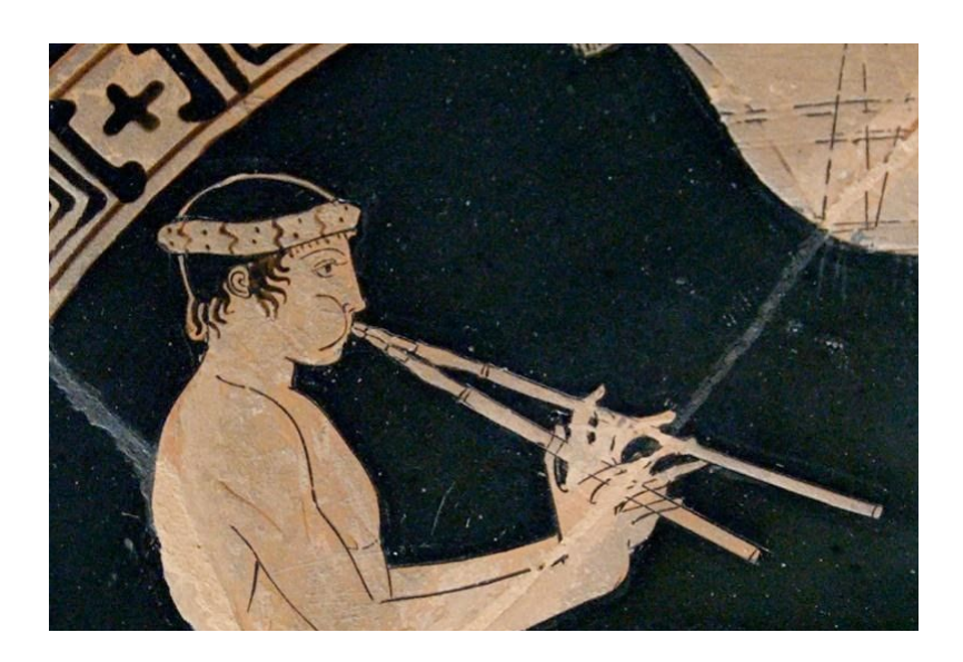
Learn about music in the ancient world and how to make and play an aulos.

Saturday April 4, 2020, 10 am-5 pm & Sunday April 5, 2020, noon-4 pm University of Mary Washington (Fredericksburg Campus)